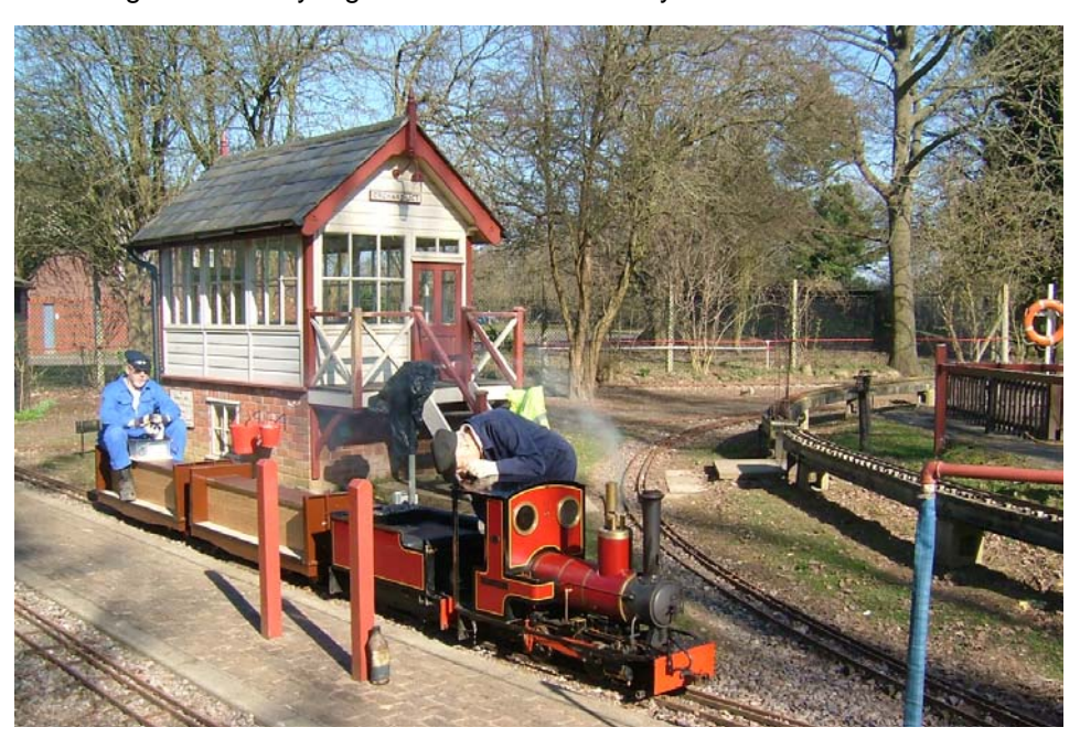
Where's the coal go?

<u>Update On bricks.</u> Unfortunately the owner informed me today that work had started on the wall rebuild and the site had been cleared. Never mind we will have to get the money together somehow and buy them.